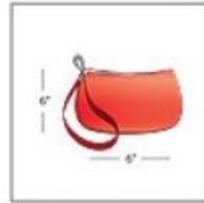
Bags smaller than 6"x6"x6"