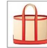
Over-sized Tote Bag