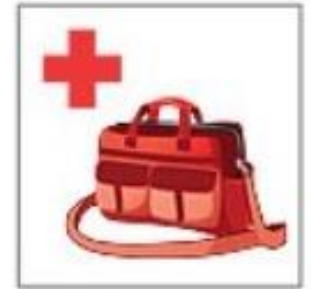
Medically Necessary and Diaper Bags*

*Infant and Medical supplies will be permitted after proper inspection.