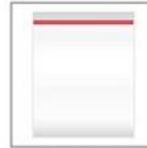
1-Gallon Plastic Freezer Bag