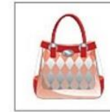
Printed Pattern Plastic Bag