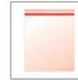
Tinted Plastic Bag