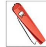
Folding Chair Bag (Folding Chair is Allowed)

FOR MORE INFORMATION GO TO PGATOUR.COM/ProhibitedItems