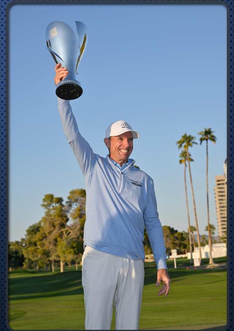
Steven Alker 2022 Charles Schwab Cup Winner